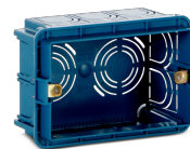
SCATOLA INCASSO TIPO 503 Code 22461