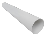
TUBO PVC D.160 L=700 (HRW) Code 22599