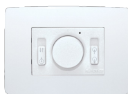
HRW RC Code 22693